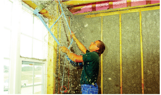
An installer “shaves” excess wet-spray cellulose fiber insulation from wall studs after it has dried.

The measures that qualify a home for ENERGY STAR make it more energy efficient than a standard home. Effective insulation, duct sealing, more efficient heating and cooling equipment, and independent testing to verify performance can result in homes using substantially less energy. Additional savings on maintenance costs also can be substantial.